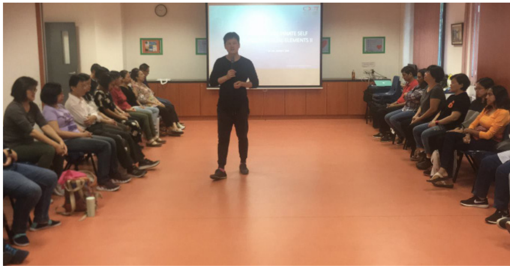
"A different perspective to the usual lecture style seminar"